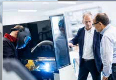
Innovation and technology consulting ewm maXsolution®