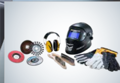
Work safety equipment, welding accessories