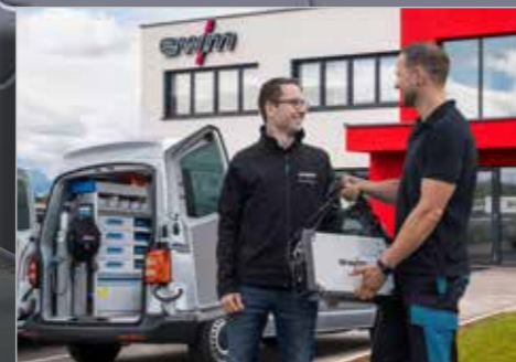
Full service wherever you are